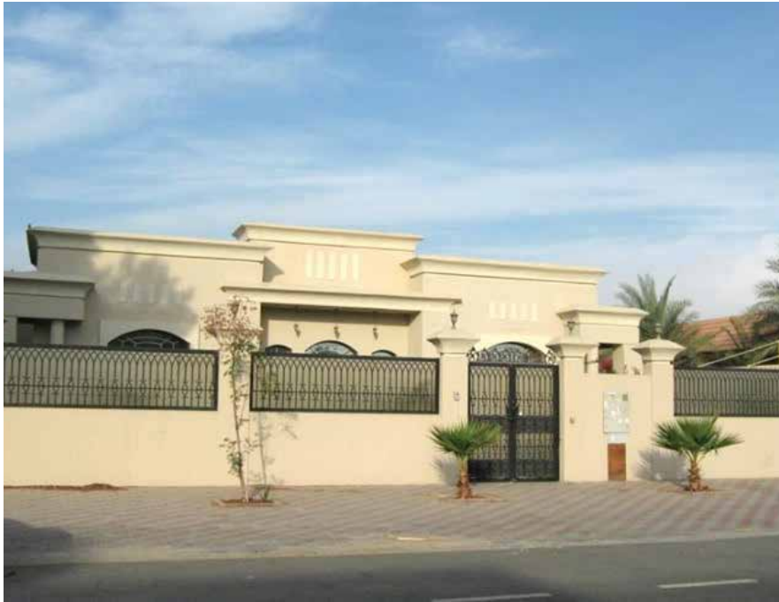
Project : Ground Floor Villa Consultant : Al Ghaith Engineering Consultants