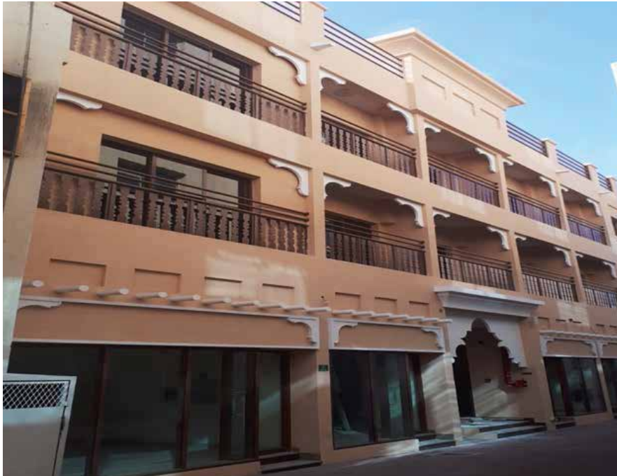
Project : G+M+1+R Building Consultant : Al Hutaib engineering Consultants