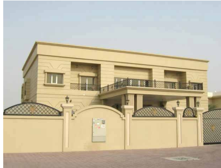
Project : G+1 Floor Villa with Outhouse Consultant : Renaissance Engineering Consultants