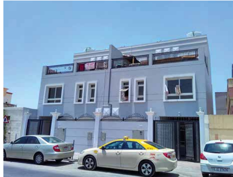
Project : G+1+R Floor Twinvilla Consultant : Al Badiya engineering consultants