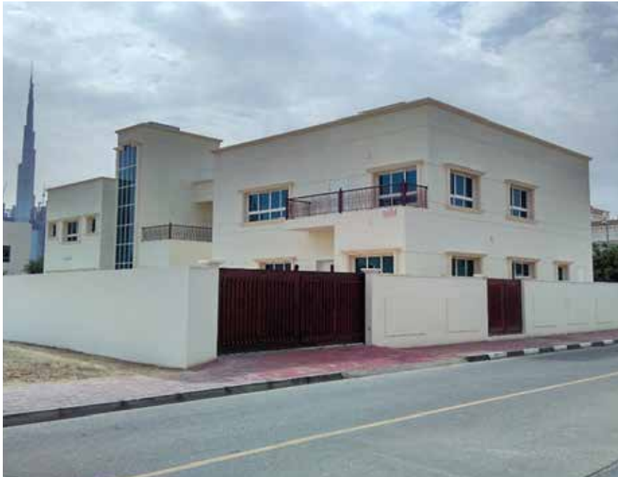
Project : B+G+1 Floors twin villa Consultant : Red Crystal engineering Consultants