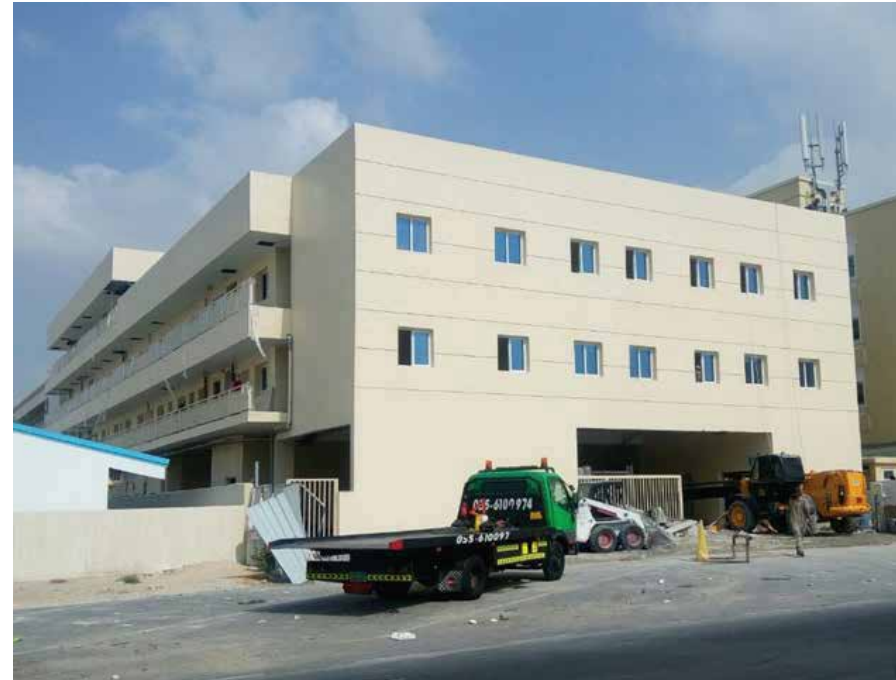
Project : G+2+R Floors Labour Camp Consultant : Red Crystal Engineering Consultants