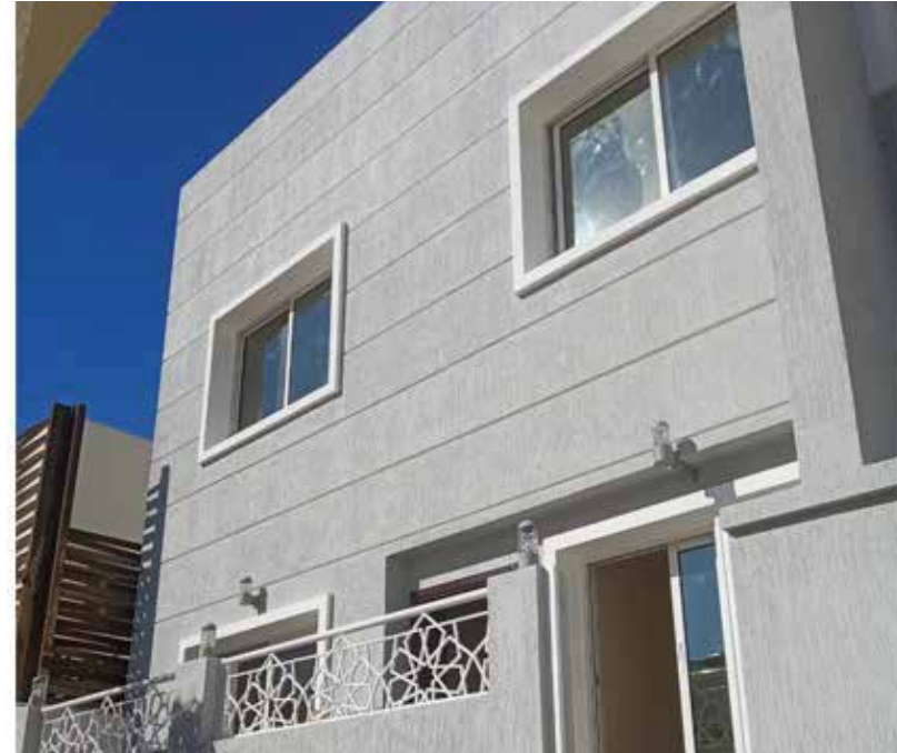
Project : G+1+R Twinvilla Consultant : Design house engineering consultancy