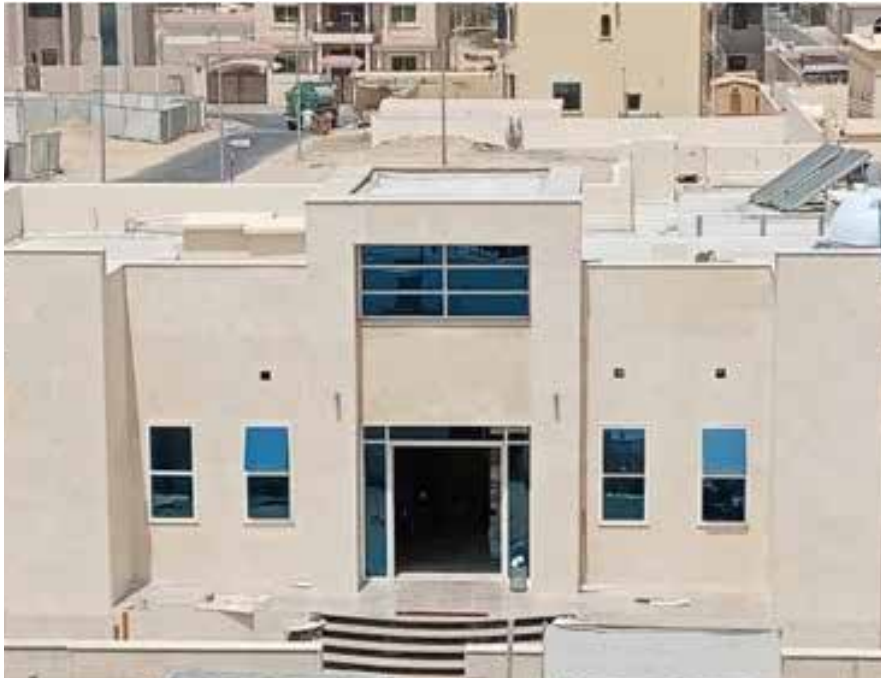
Project : G floor Villa with Service block Consultant : Red Crystal engineering consultancy